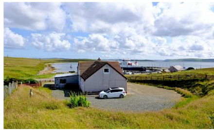
Vegadaal from rear, showing sea views.