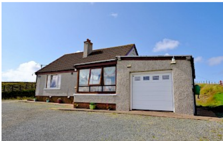
Vegadaal from front.