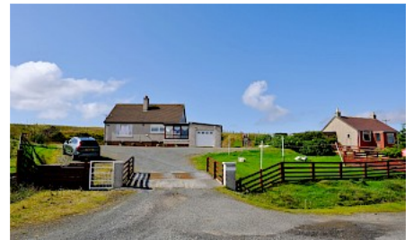
Situation of property from the road side.