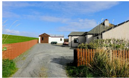
Entrance to Greenhill showing driveway and garage.