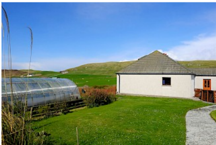
Garden showing polytunnel.