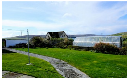
Garden showing polytunnel and drying green.

Note: While the foregoing particulars are believed to be correct, their accuracy is not guaranteed and they do not form part of any contract. The dimensions given are approximate only and are not warranted. Photographs may have been taken with a wide angle lens.