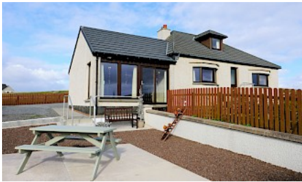
Greenhill showing patio area.