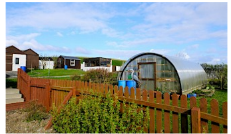
Garden showing various outbuildings and polytunnel.