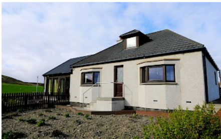
Greenhill from front.