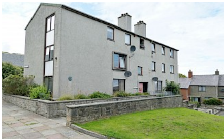
Mounthooly Place from front - Flat 1 is on the left.