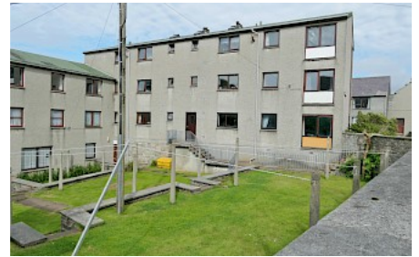
Mounthooly Place from rear - Flat 1 is on the right.