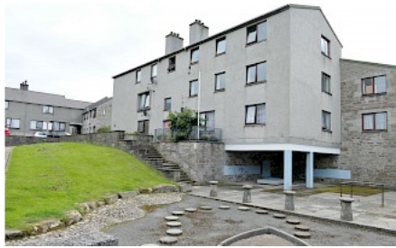
Mounthooly Place, showing staircase to the entrance of the building.