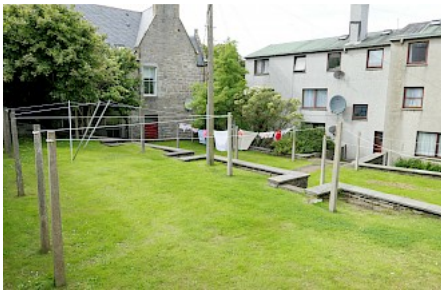
Rear drying green.