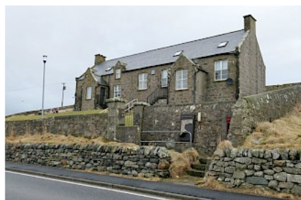
Situation of Firth Old School