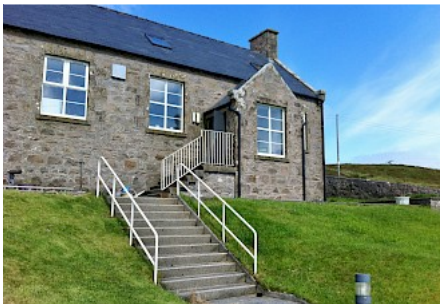
Firth Old School

Some work has been carried out on the property since it went on the market; pointing the exterior walls, and new guttering. This will be reflected in an updated Single Survey, to be completed in due course.