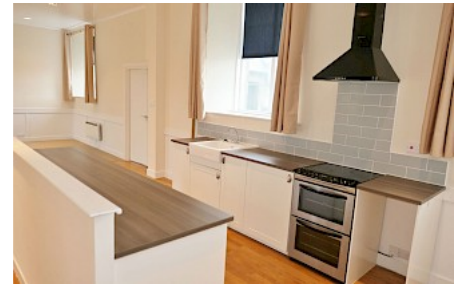
Open-plan Living Room & Dining Kitchen