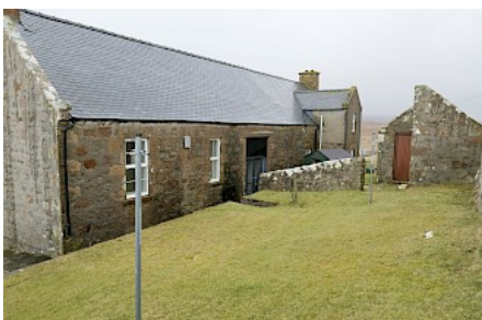
Old School from rear showing location of drying green and garden shed