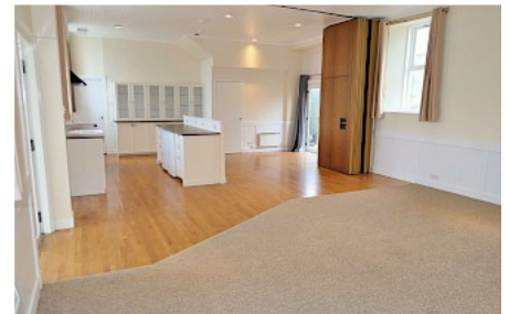
Open-plan Living Room & Dining Kitchen