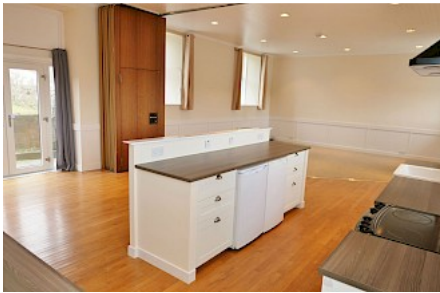
Open-plan Living Room & Dining Kitchen