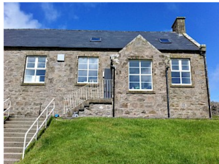
Old School from front