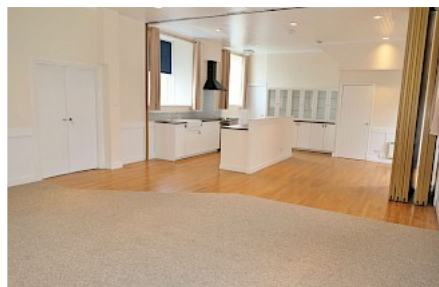
Open-plan Living Room & Dining Kitchen