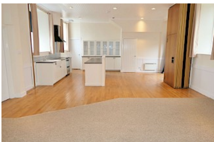
Open-plan Living Room & Dining Kitchen