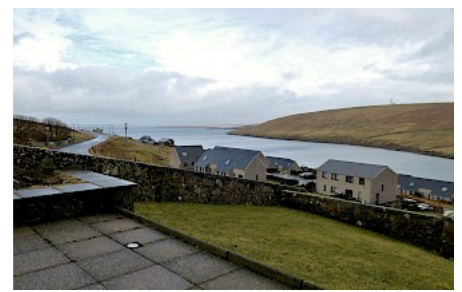
View from front garden.