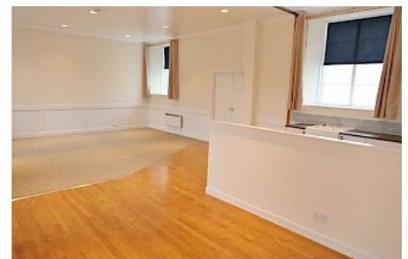
Open-plan Living Room & Dining Kitchen