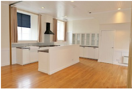
Open-plan Living Room & Dining Kitchen