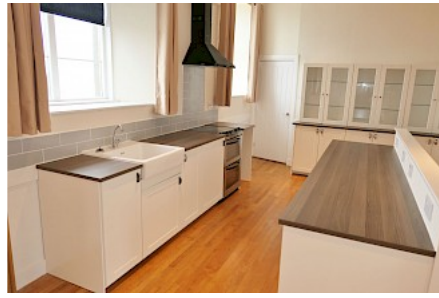
Open-plan Living Room & Dining Kitchen