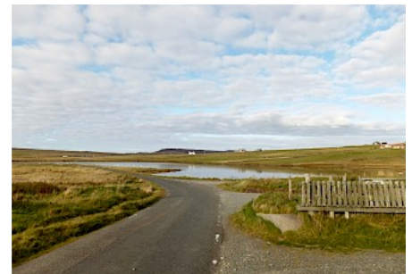
View north, showing loch and driveway.