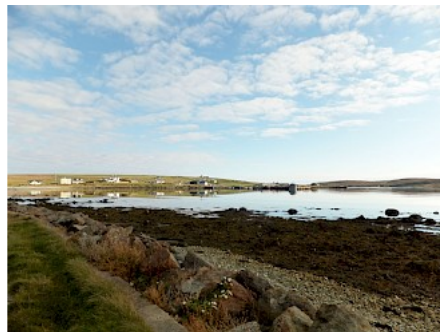
Situation of 1 Batavia, the second property on the left.