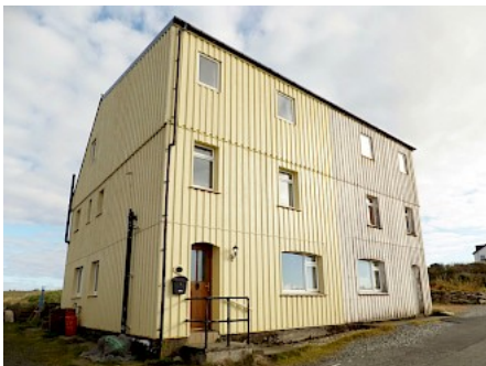
1 Batavia from front.

The sale of 1 Batavia includes all fixtures and fittings, and some furniture may be available to purchase by separate negotiation.