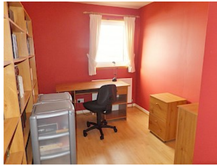
Office / Bedroom 6

Note: While the foregoing particulars are believed to be correct, their accuracy is not guaranteed and they do not form part of any contract. The dimensions given are approximate only and are not warranted. Photographs may have been taken with a wide angle lens.